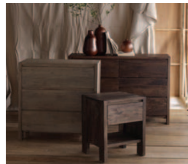
Boerum Storage Collection. Natural or cafe. $249-$799