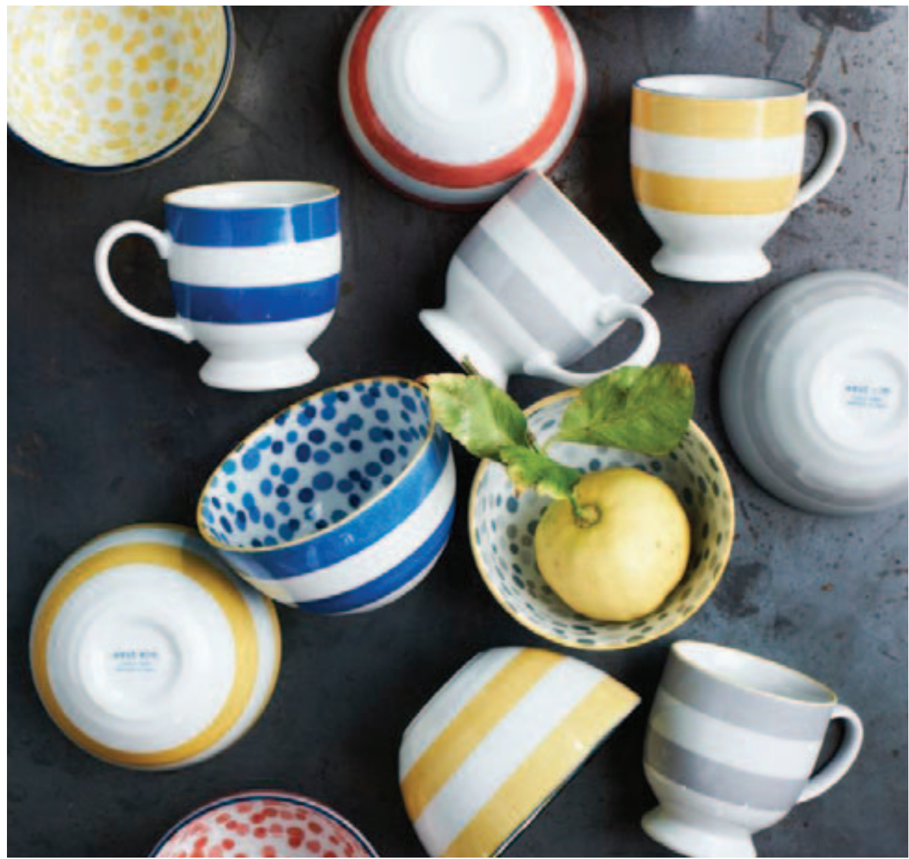
Dots + Stripes Mug. Blue, red, yellow or gray. $10