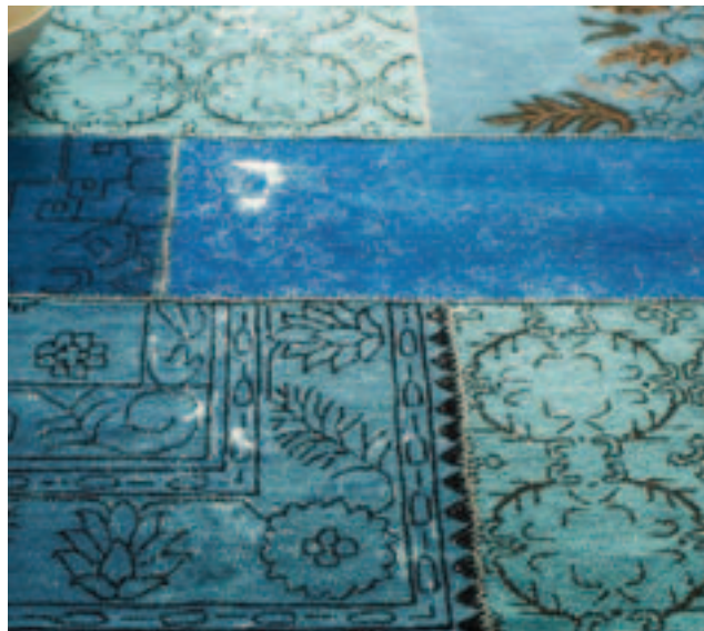
Cadiz Rug. Ink. $199-$1,299