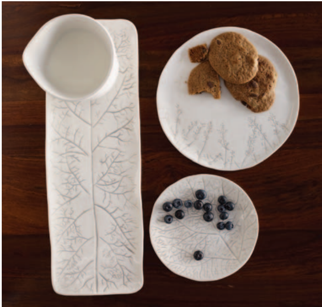
Texture Botanical Serveare. Ivory. $14-$29