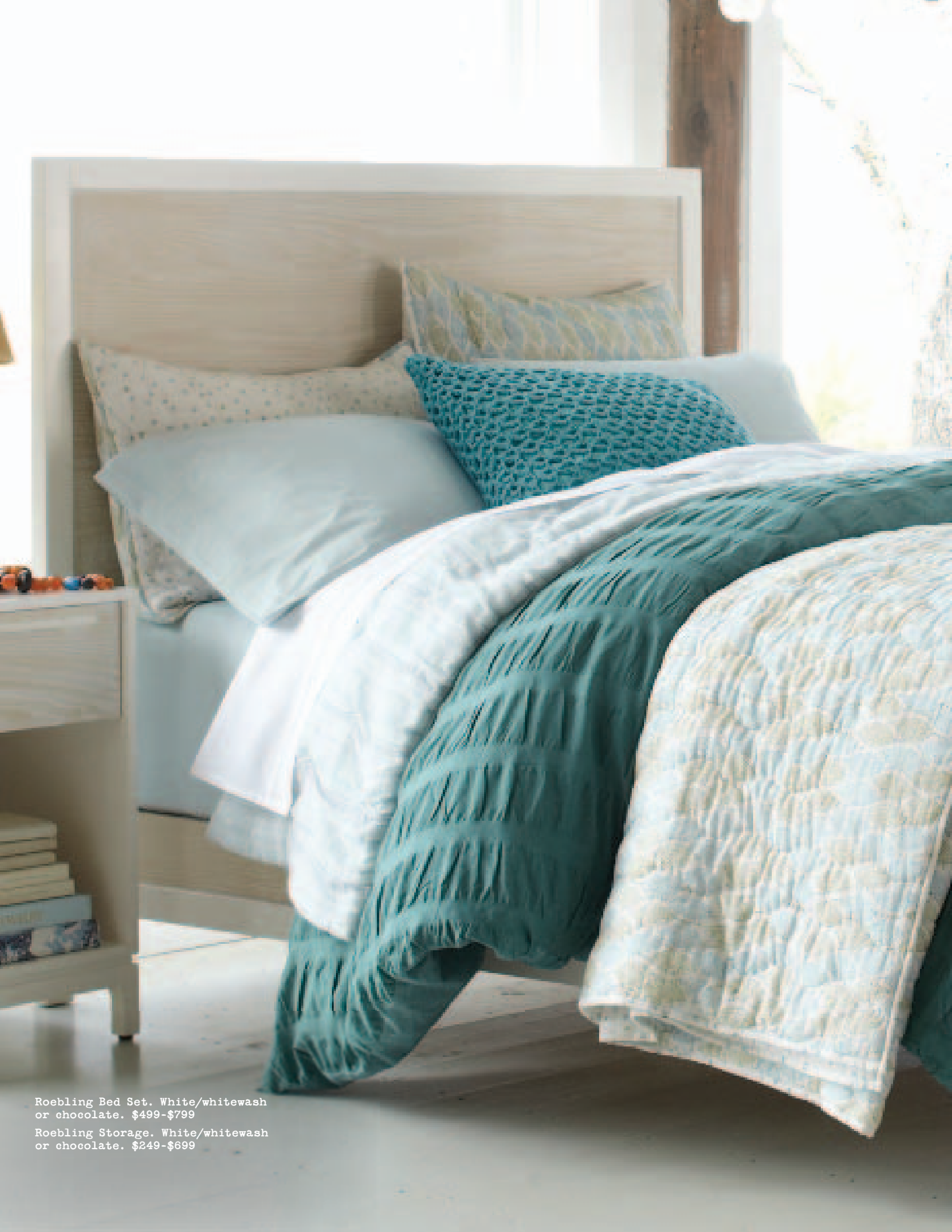
Roebing Bed Set. White/whitewash or chocolate. $499-$799 Roebing Storage. White/whitewash or chocolate. $249-$699