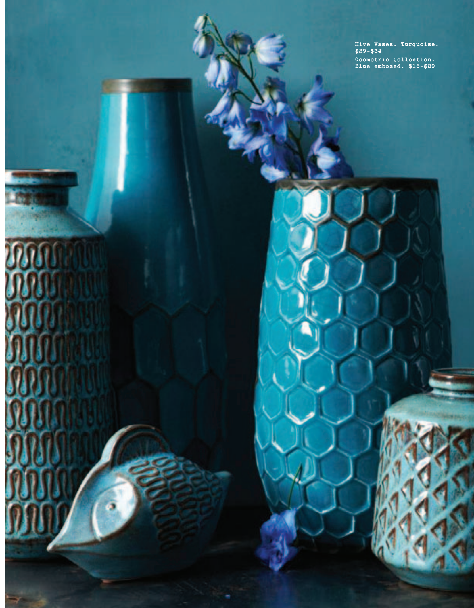
Hive Vases. Turquoise. $29-$34 Geometric Collection. Blue embossed. $16-$29