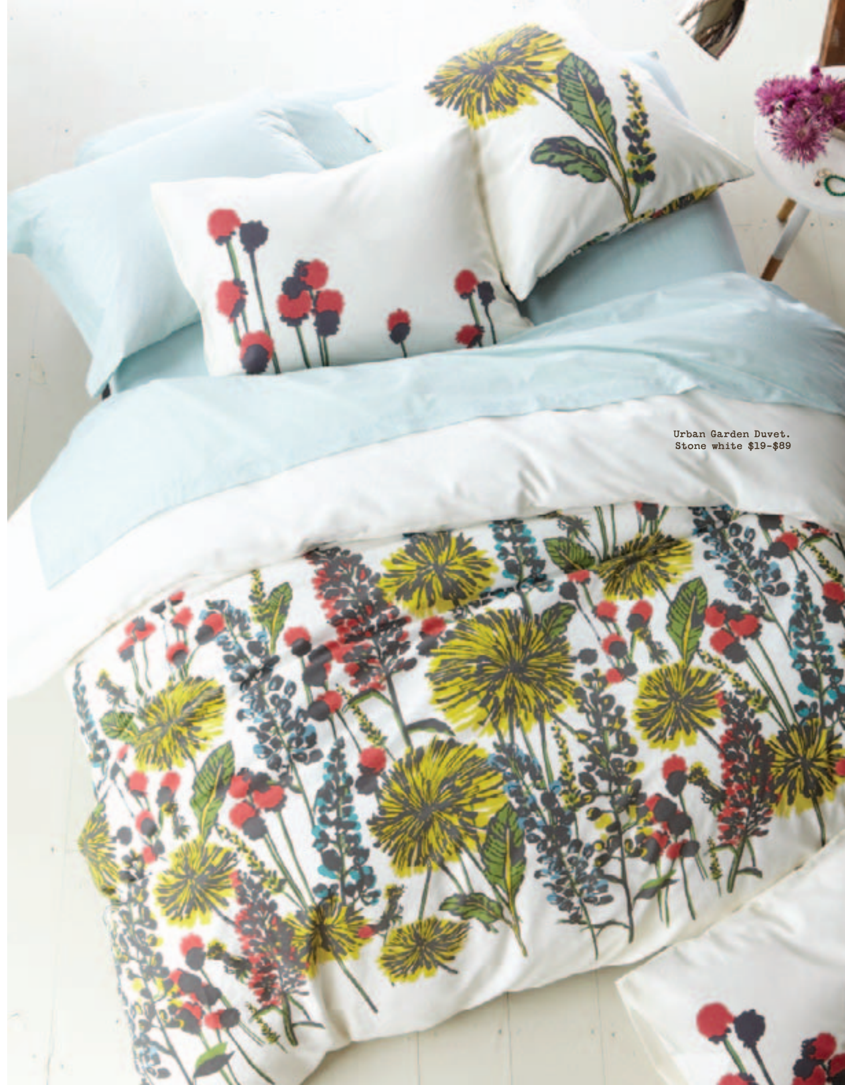
Urban Garden Duvet. Stone white $19-$89