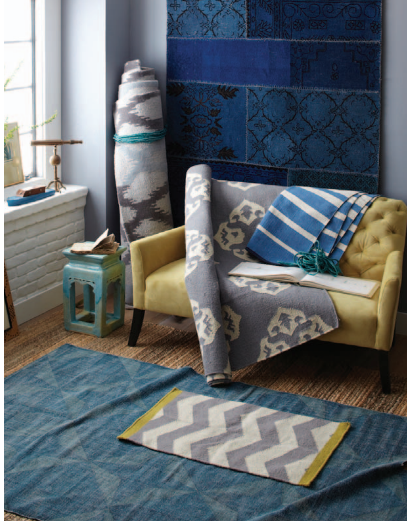
Gradiated Strip Cotton Rug. Iron, poolside blue, citron or tangerine. Washed Hexagon Dhurrie. Sea isle. $29-$199 Zig Zag Rug. Platinum/ivory/citron. espresso/ivory/citron or iron/ivory/fez red. $49-$699