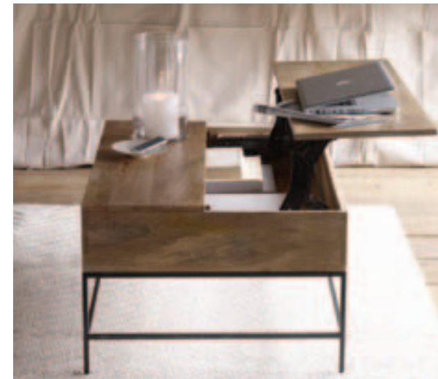
Rustic Storage Coffee Table. Raw mango. $499