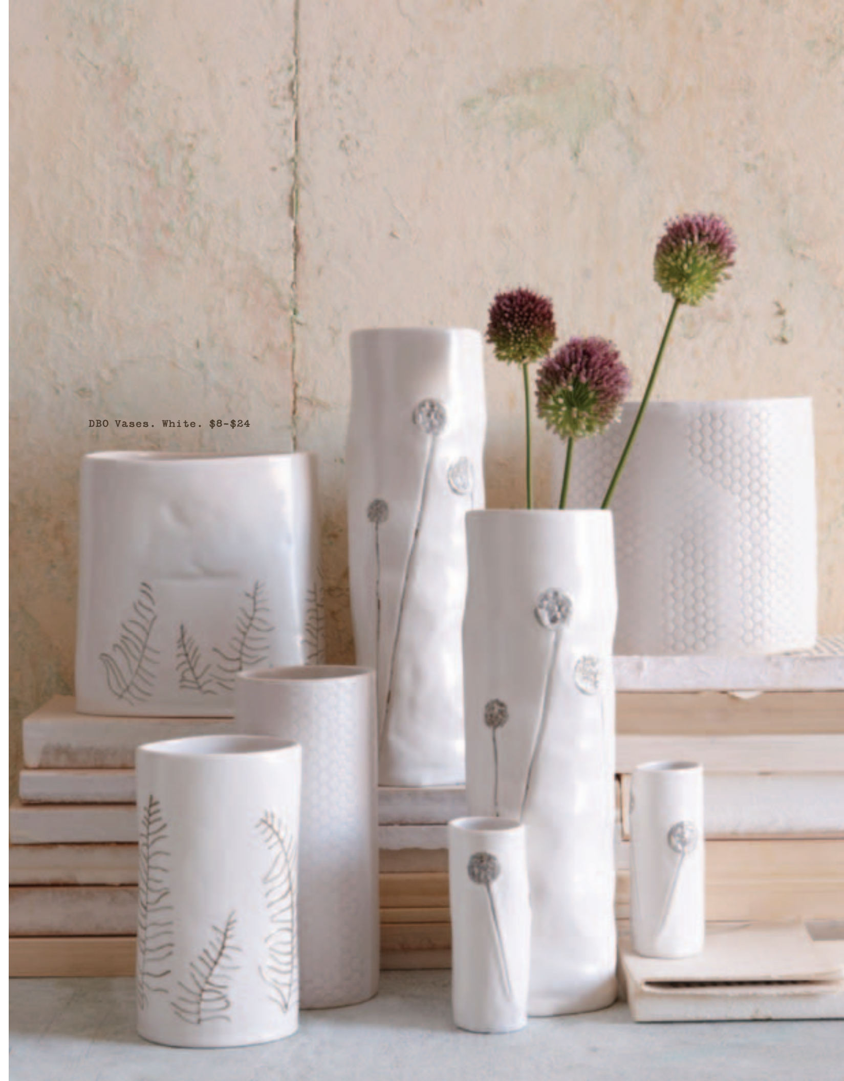
DBO Vases. White. $8-$24