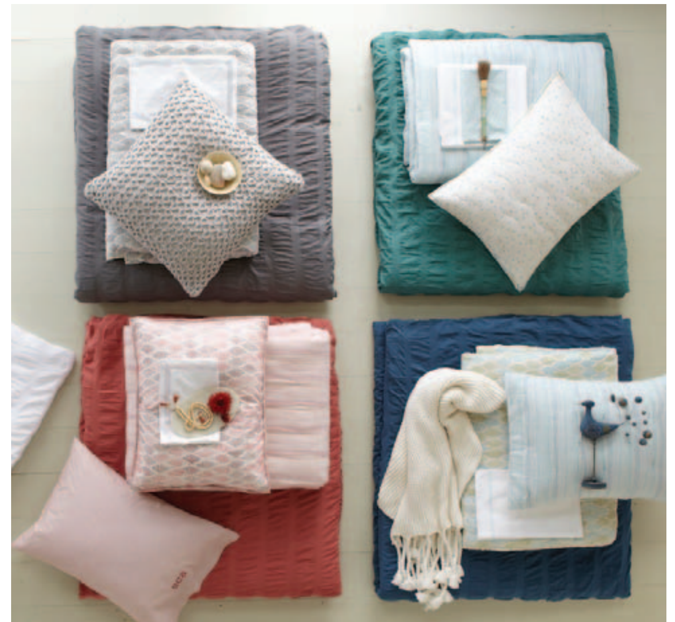
Seersucker Duvet. True gray, pacific, coral rose, golf blue or white $24-$169