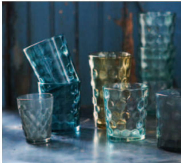
Dimpled Drinkware. Smoke, turquoise, amber or clear. $16-$24 set of 4