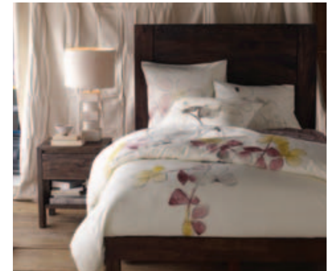
Boerum Headboard. Natural or cafe. $449-$599 Sylvan Bed Frame. Natural or cafe. $299-$449