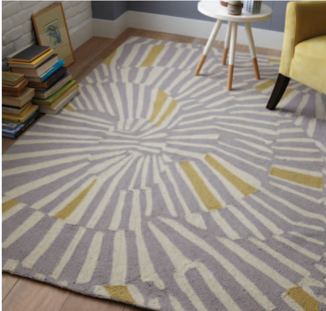
Lourdes Sanchez Swirl Rug. Platinum. $129-$799 Ikat Links Rug. Frost Gray. $129-$799 Andalusia Rug. Feather Gray/ivory, horizon/ivory or espresso/ivory. $49-$699