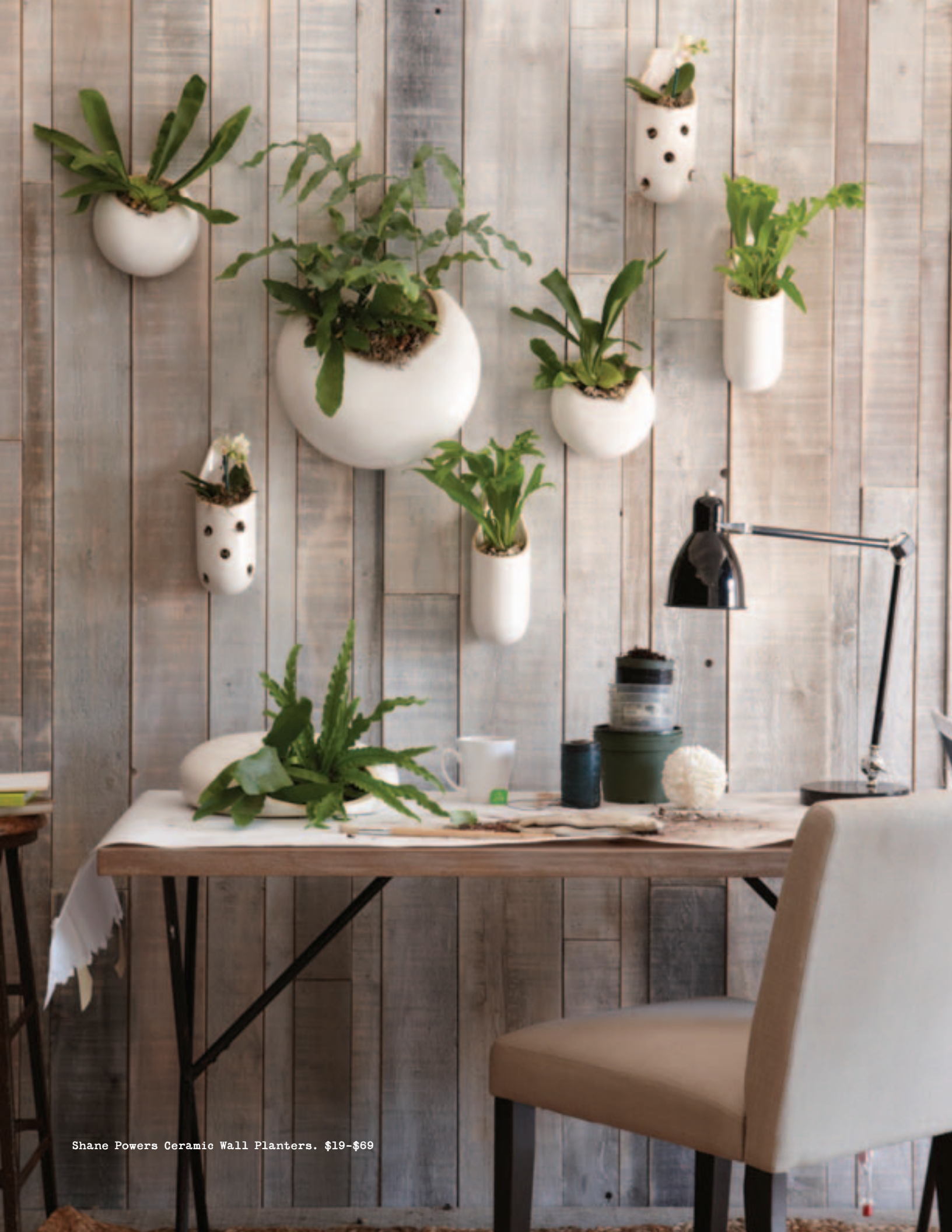
Shane Powers Ceramic Wall Planters. $19-$69