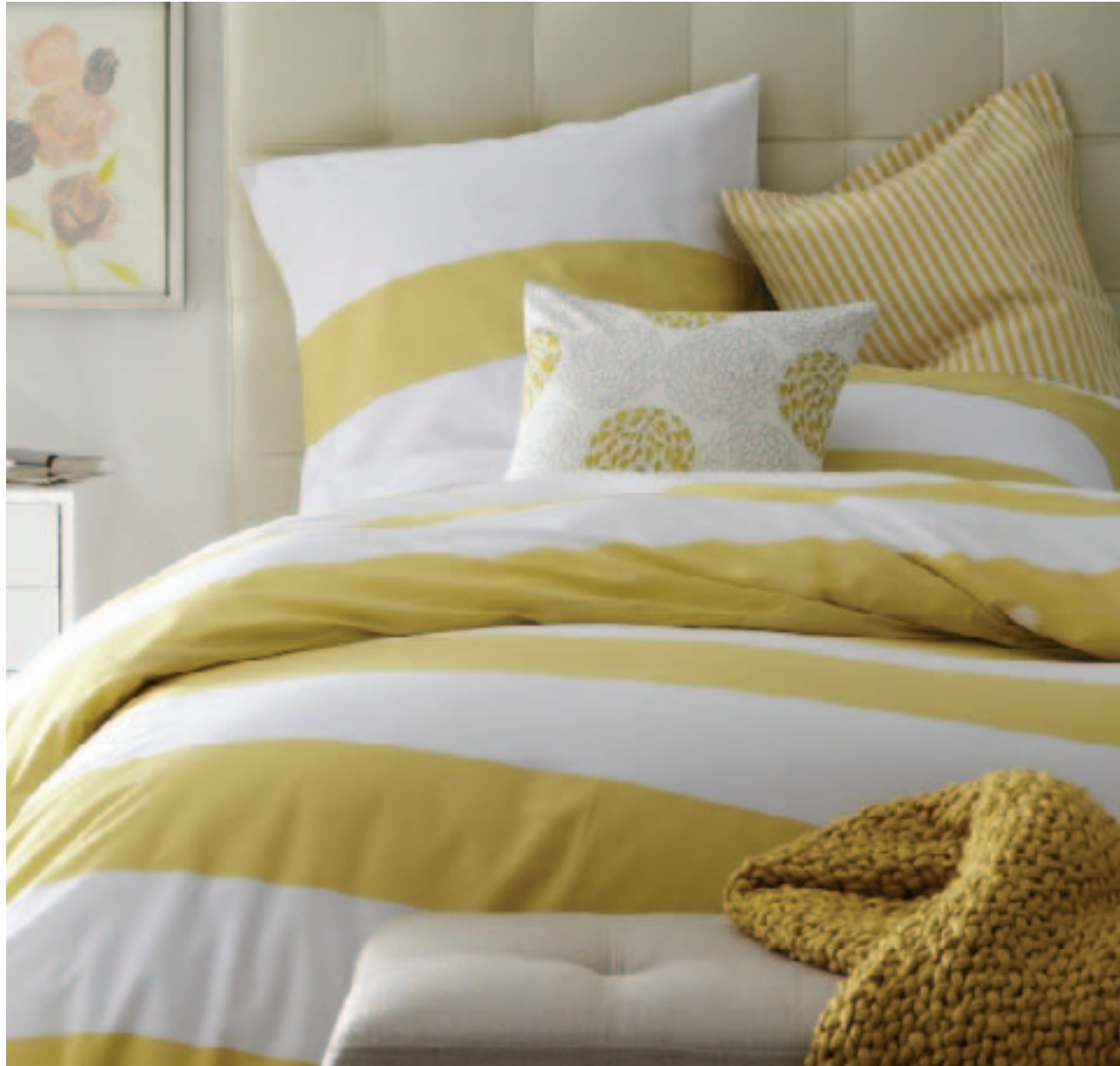
Tall Grid Tufted Headboard. Ivory or elephant leather, also available in special order upholstery. $499-$649