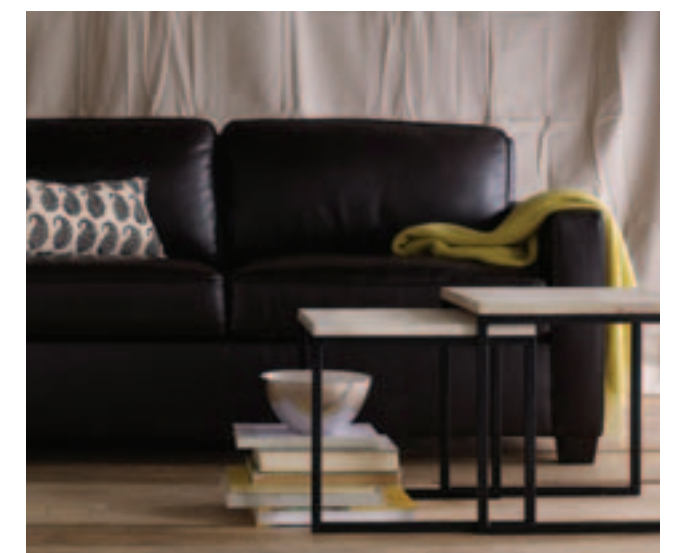
Henry Leather Sofa. Coffee leather. $1,499 Box Frame Nesting Tables. Whitewash mango. $249