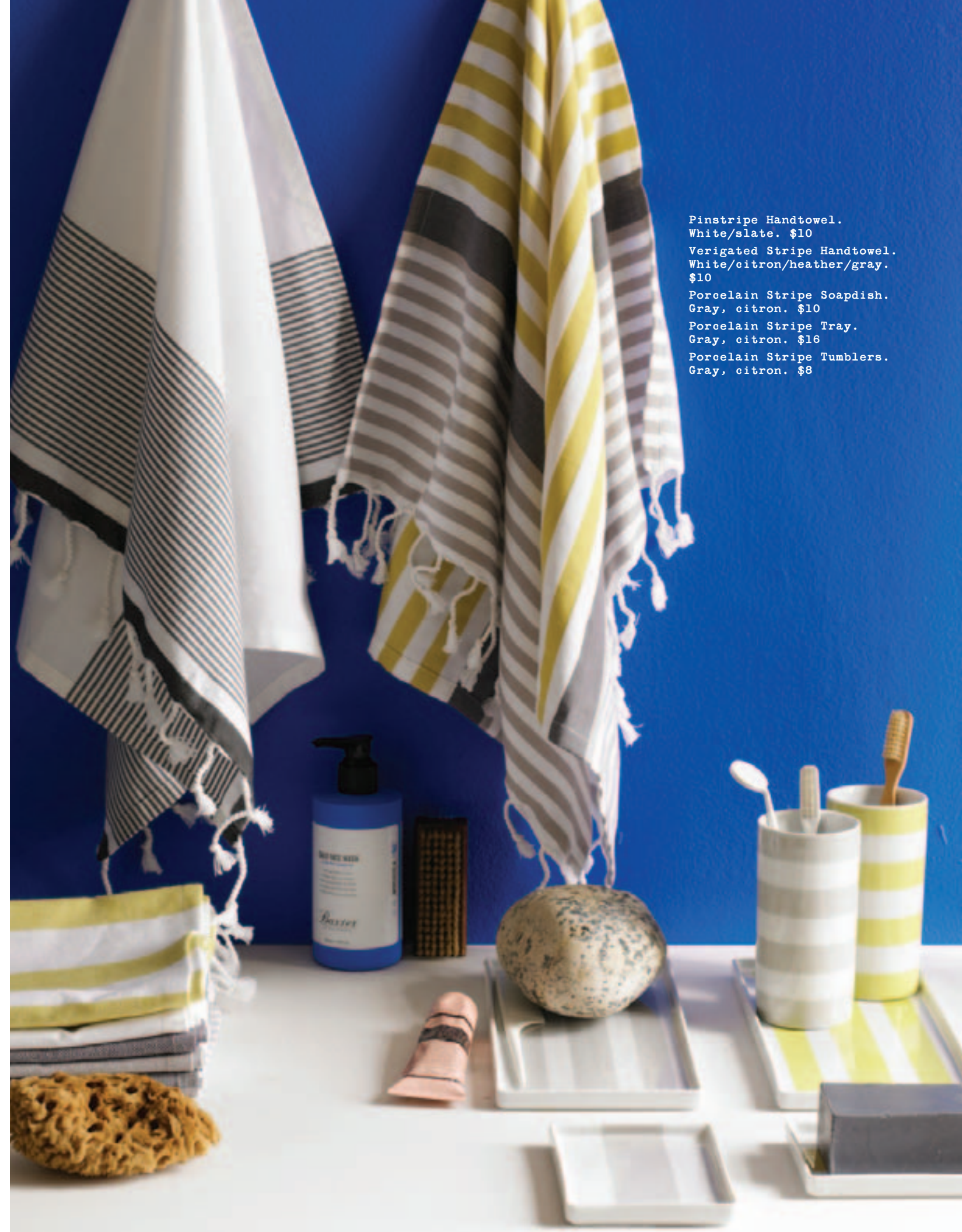
Pinstripe Handtowel. White/slate. $10 Verigated Stripe Handtowel. White/citron/heather/gray. $10 Porcelain Stripe Soapdish. Gray, citron. $10 Porcelain Stripe Tray. Gray, citron. $16 Porcelain Stripe Tumblers. Gray, citron. $8