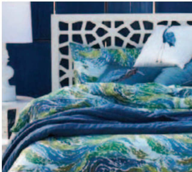
Organic Oasis Duvet. Washed lagoon. $24-$109