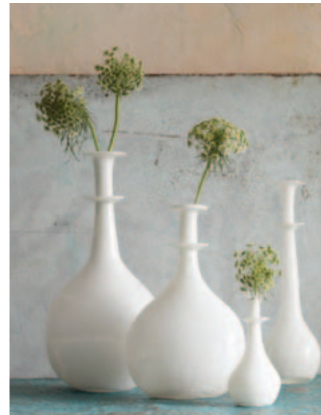
Shane Powers Opal Glass Vases. Opal Glass $19-$49