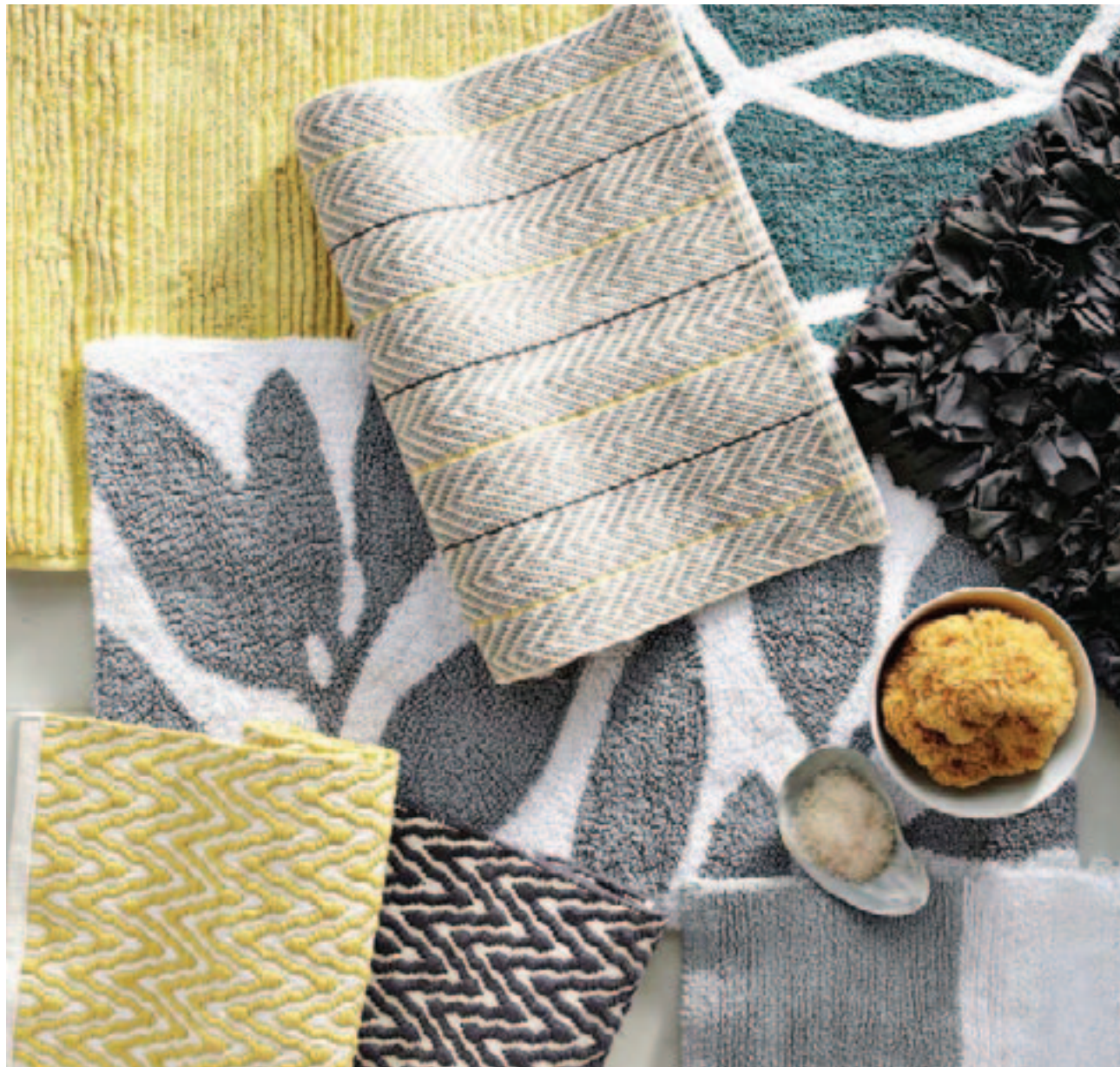
Fez Bathmat. White/heather gray/ citron. $29 Bamboo Bathmat. White/heather gray. $24