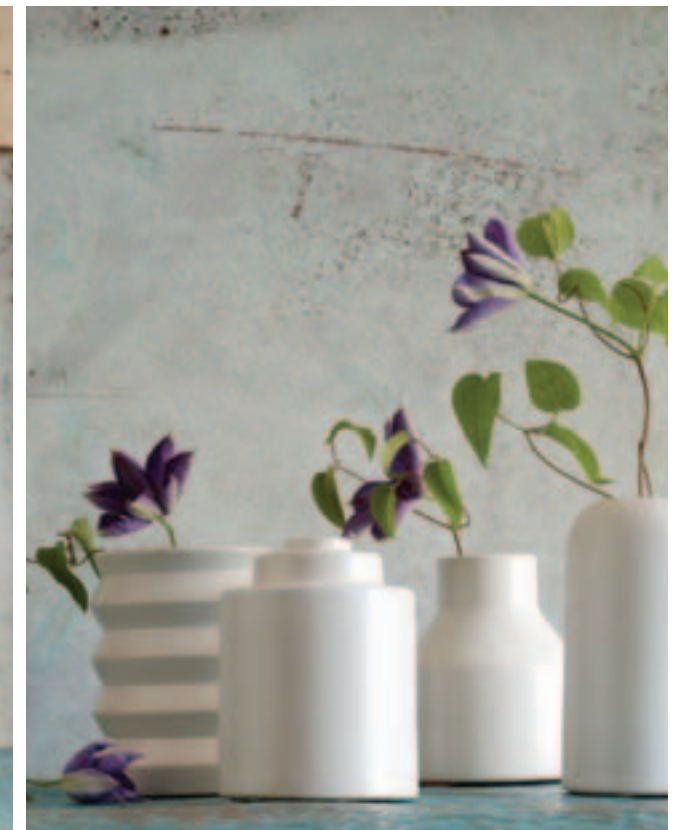
Shane Powers Bud Vases. White. $16